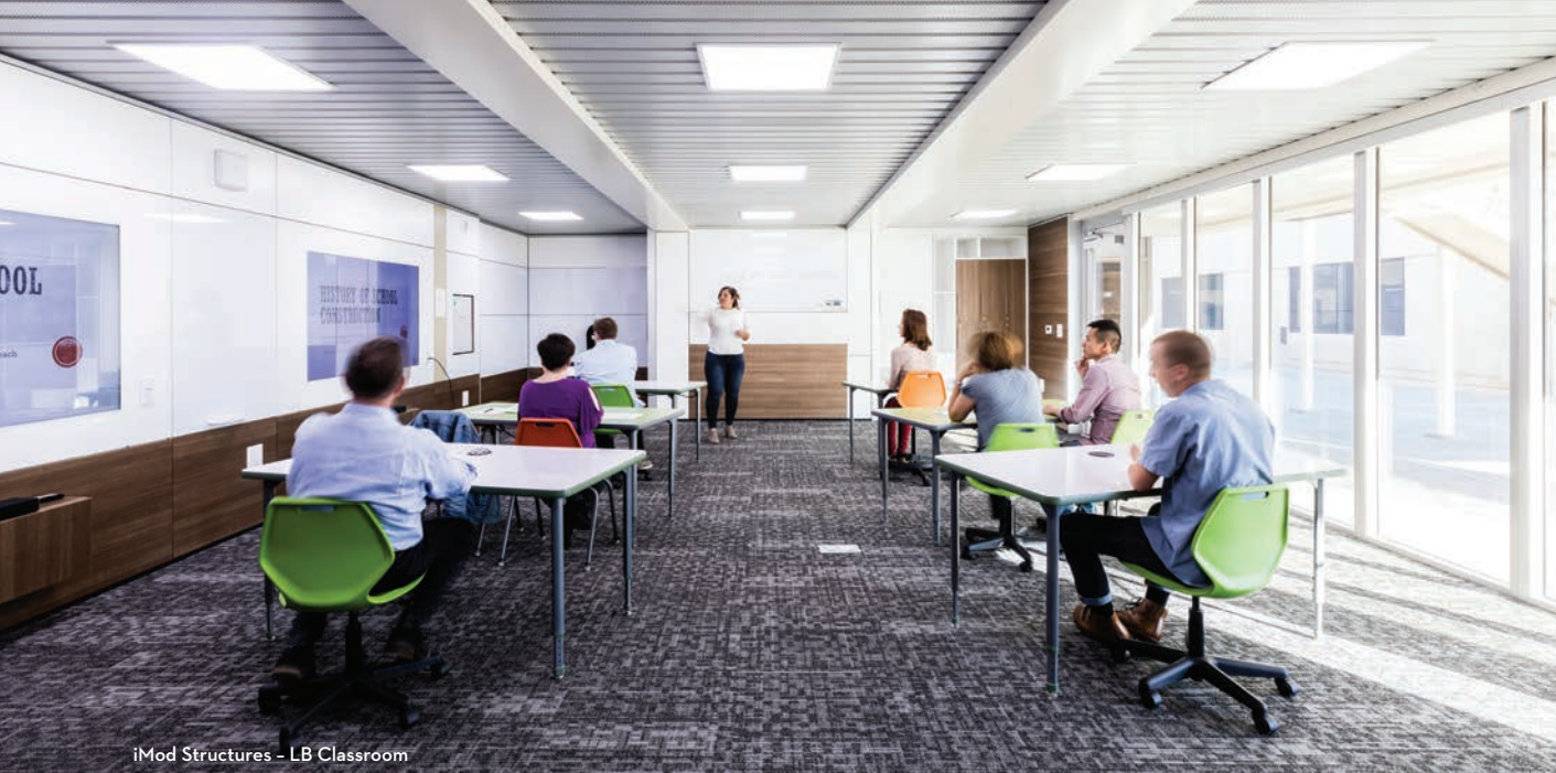
iMod Structures - LB Classroom

the California State University Maritime Academy in Vallejo, Gateway Charter School in Sacramento and Mare Island Technology Academy, a charter middle and high school in Vallejo. iMod classrooms are scheduled to be installed at those campuses through this summer and into the fall.